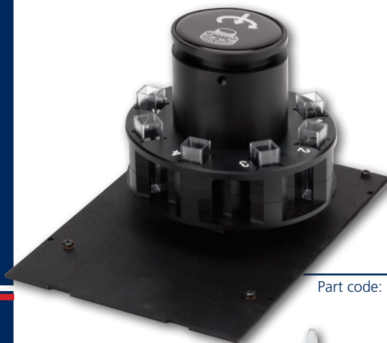
Part code: 735 401